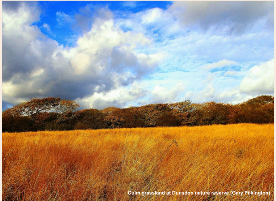
Culm grassland at Dunsdon nature reserve (Gary Pilkington)