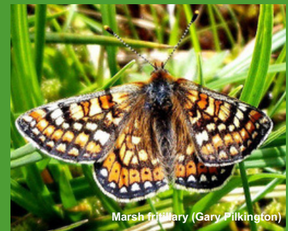
Marsh fritillary