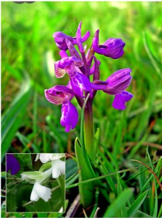
Green-winged orchid, Anacamptis morio.

The species name, morio, is derived from the Greek word 'moros' meaning 'fool'. This refers to the colourful, green striped flowers; see inset (darker flowers tend to have greyish purple stripes).