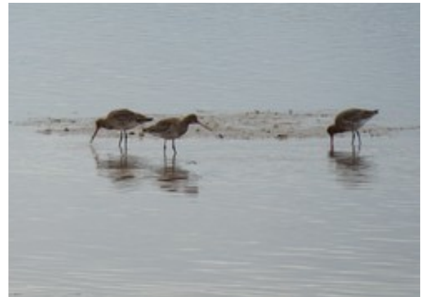
Black Tailed Godwit