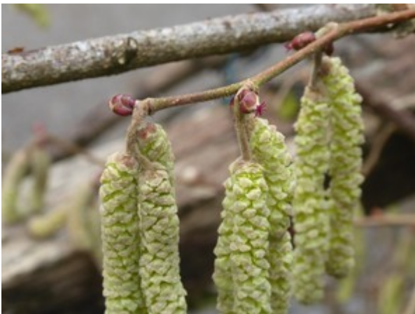
Hazel catkins with female flowers

On Church Path we came across these Hazel catkins. The tiny red female flowers are just visible at their base, and these will grow and develop over the coming weeks.