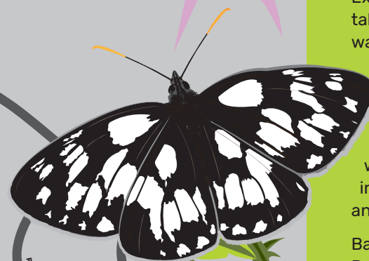
Marbled white butterfly