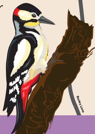
Great spotted woodpecker