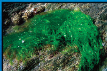
Gutweed Ulva intestinalis