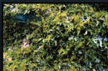
Pepper dulse Osmundea pinnatifida