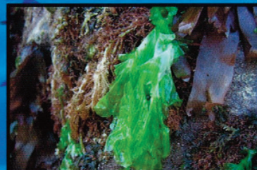
Sea lettuce Ulva lactuca