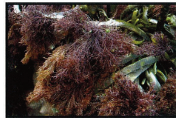
Polysiphonia lanosa (found on Egg wrack)