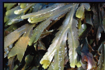
Serrated wrack Fucus serratus