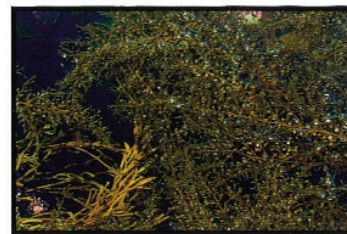
Wireweed Sargassum muticum ; a non-native species