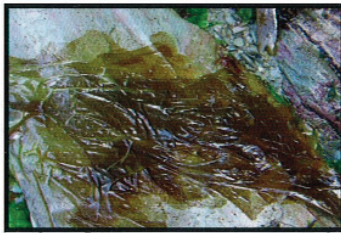
Laver Porphyra umbilicalis