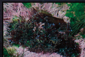
Irish moss Chondrus crispus ; centre and Coral weed Corallina officinalis ; pink seaweed around edges