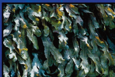
Spiral wrack Fucus spiralis