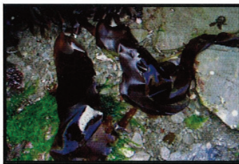
Oarweed Laminaria digitata