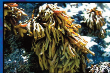
Channelled wrack Pelvetia canaliculata