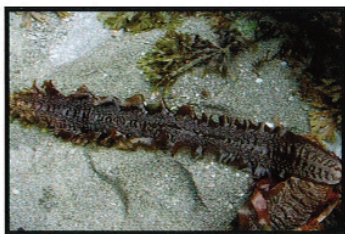
Sugar kelp Laminaria saccharina