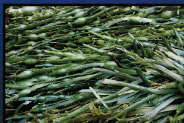
Egg wrack Ascophyllum nodosum