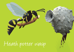
Heath potter wasp

In summer, look out for small collections of clay clinging to plants alongside paths. These