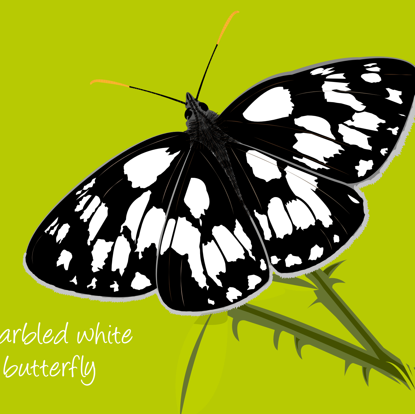
Marbled white butterfly

Enter Teigngrace Meadow and you'll be stepping into a landscape created from the excavations of local clay mining. In summer, it is home to green-winged orchids and butterflies,