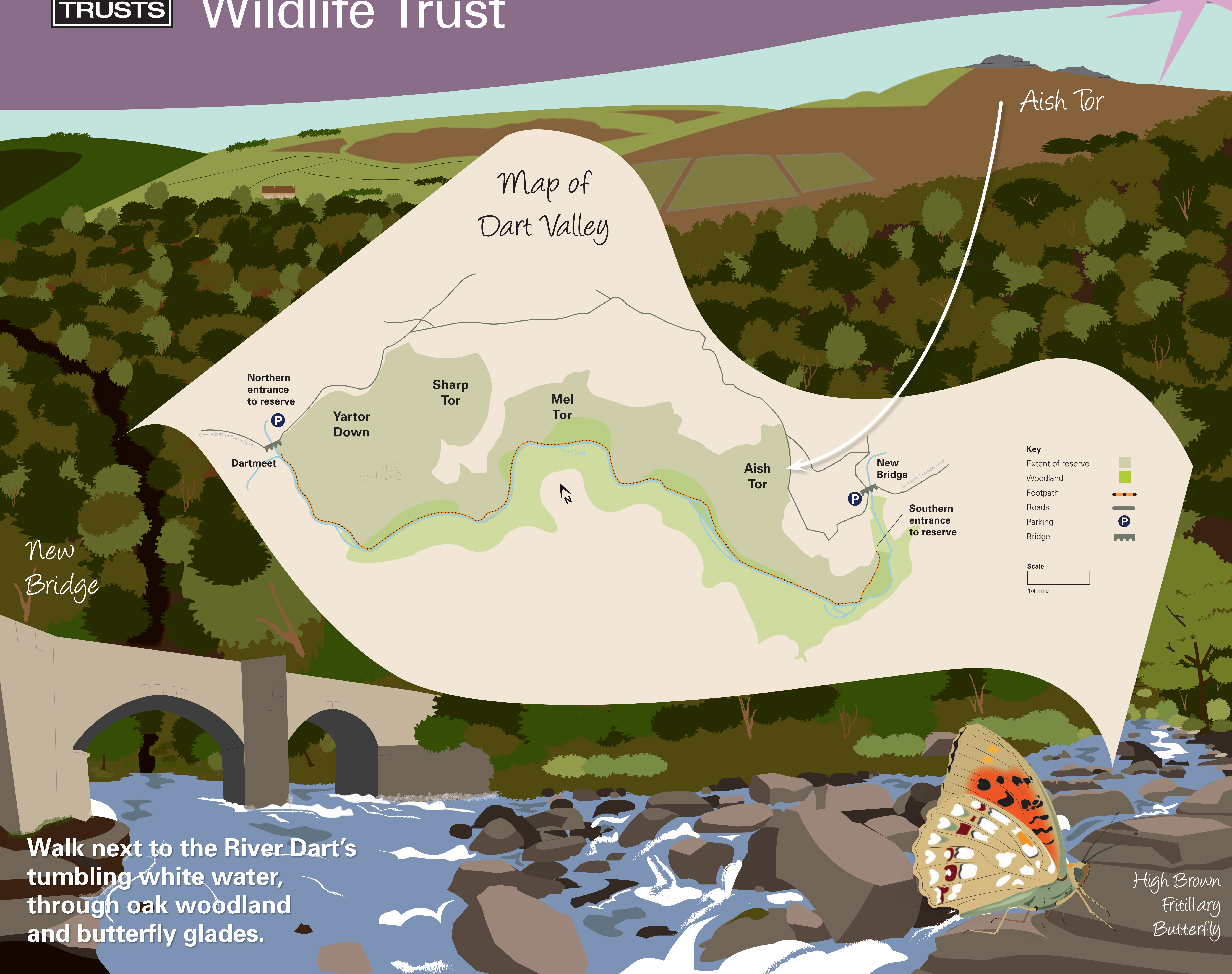
Map of Dart Valley