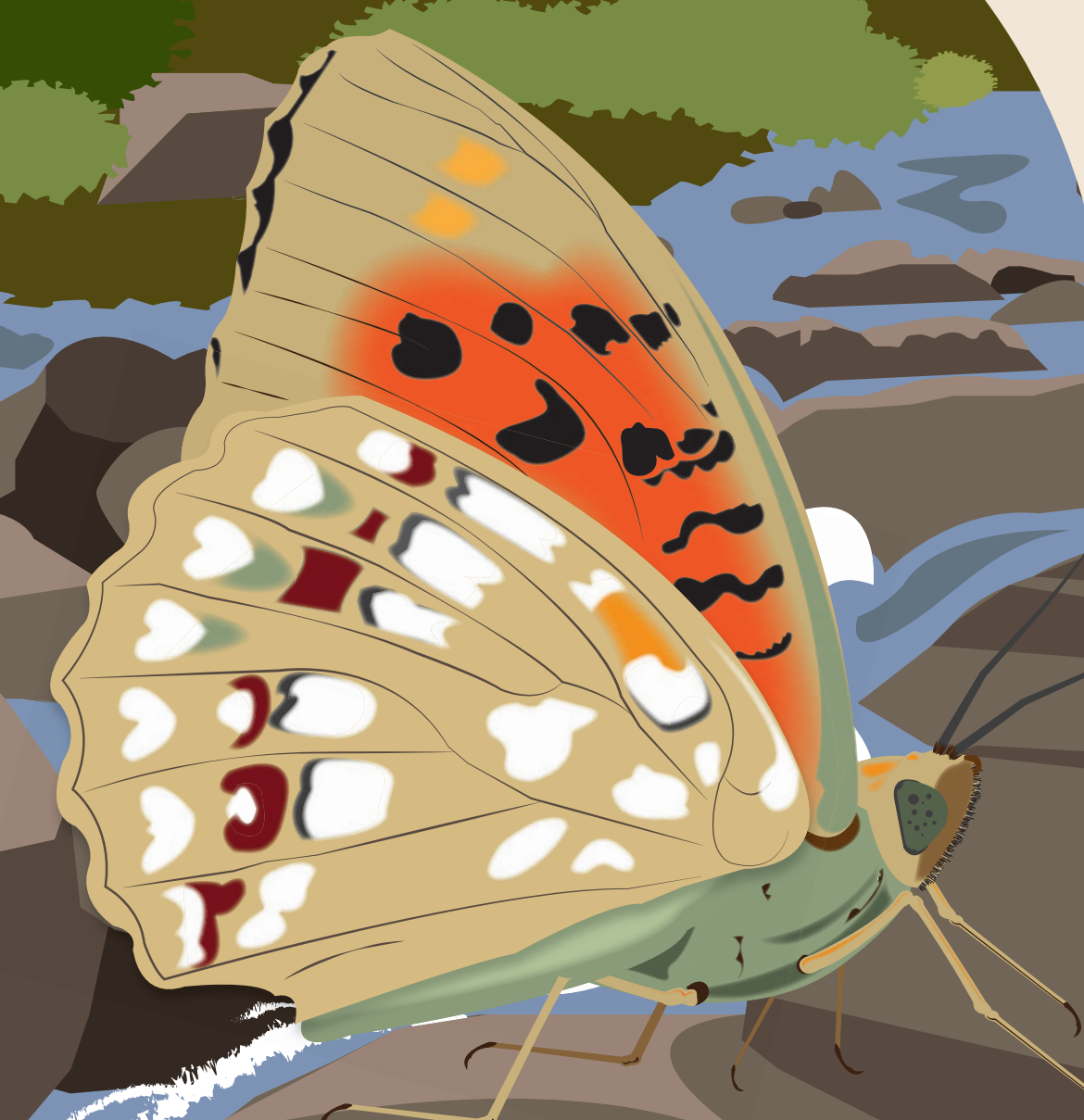
High Brown Fritillary Butterfly

Walk next to the River Dart's tumbling white water, through oak woodland and butterfly glades.