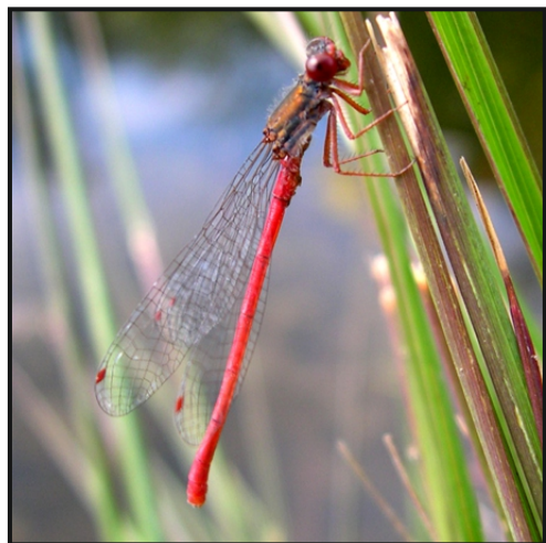
Small red damselfly