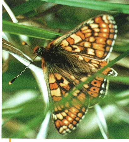
Marsh fritillaries are one of Europe's 12 most endangered species