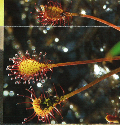
Sundews are insect-eating plants - S. Day

Rackenford and Knowstone Moors form an enormous expanse of open moorland where large wild animals roam free. Herds of red deer led by majestic, antlered stags and locally owned cattle wander at will over the unfenced land.