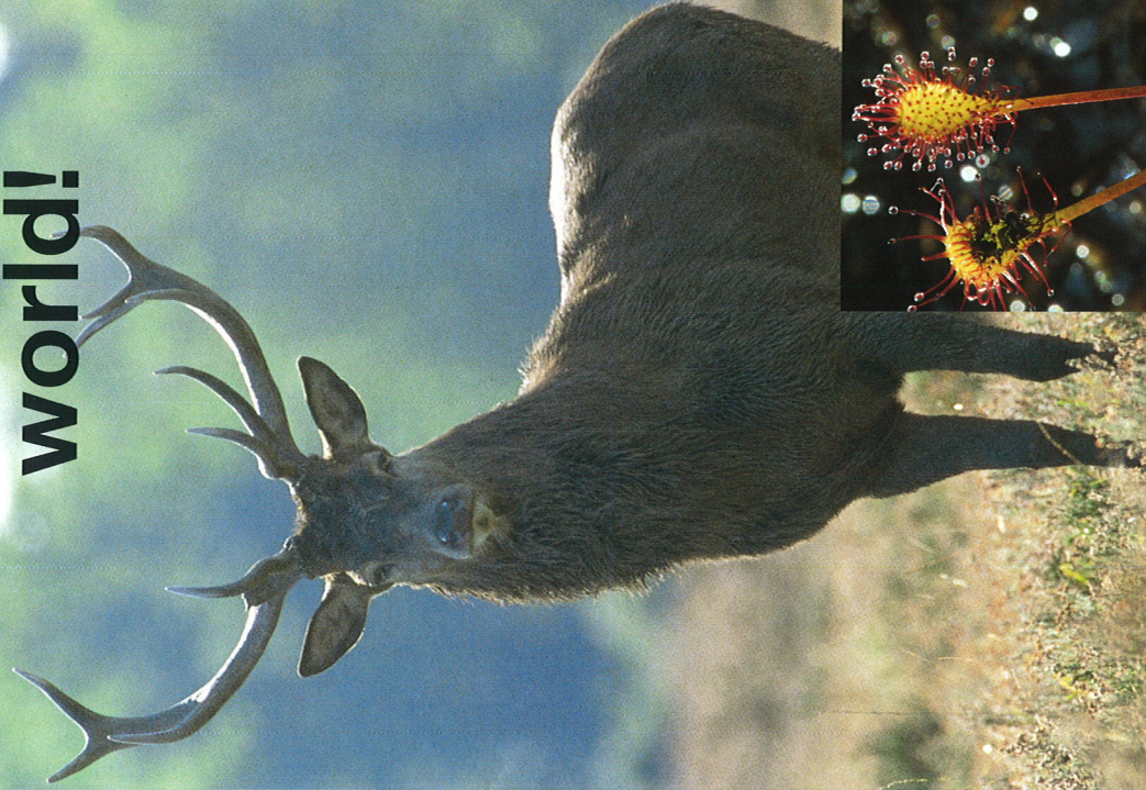
Majestic red deer roam the moor. - M. Peadar