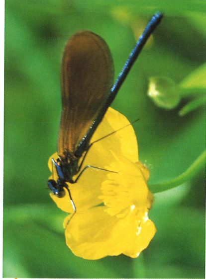
Beautiful damselflies like fast flowing streams – J Chubb

Times have changed but this land has remained a functional part of the village. It was once open fields and belonged to the mill, it hosted a busy railway route, had vegetable plots and chicken runs. Now it's a place for wildlife to thrive.