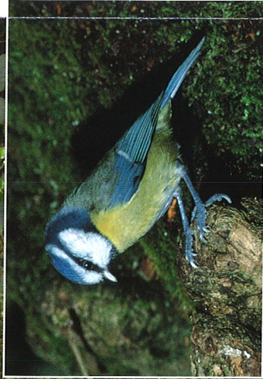
Blue tits nest in the reserve and village gardens

Mill Bottom has a closed in feel – ancient granite boulders hide amongst the trees and the rocks' cracks create the perfect spot if local bats want to hang out.