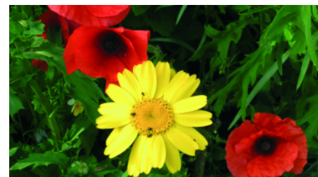
poppies and corn marigold

The Ringlet butterfly needs meadow grasses on which to breed